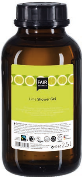
SHOWER GEL LIME

Shower gel for dry or sensitive skin. Olive oil has been used for centuries to gently cleanse and moisturize the skin. Olive oil is rich in natural vitamins, minerals and essential fatty acids that can rejuvenate the skin with its anti-aging properties. Pampers your skin with a fresh scent of lime.