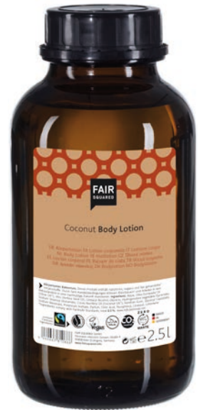
BODY LOTION COCONUT

2500 ML COSMETAINER ART.-NO.: 4910482 EAN: 4260663810897