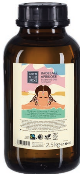
GDG BATH SALT APRICOT

2500 ML COSMETAINER ART.-NO.: 4910476 EAN: 4260663810835