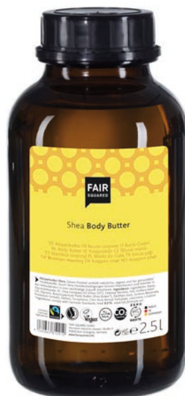
BODY BUTTER SHEA

For centuries shea butter has been one of the most important beauty products for women in Africa. Shea butter and olive oil are rich in natural vitamins, minerals, essential fatty acids and antioxidants that improve the skin rejuvenate through their anti-aging properties. Moisturizes and makes the skin smooth, soft and radiant.