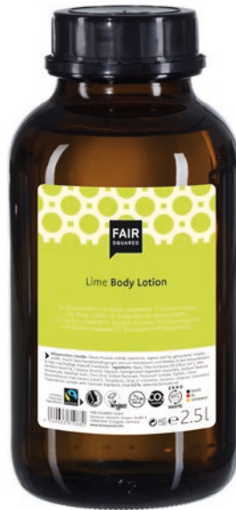
BODY LOTION LIME

2500 ML COSMETAINER ART.-NO.: 4910493 EAN: 4260663810873