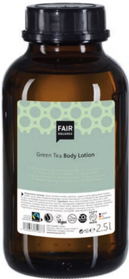
BODY LOTION GREEN TEA

The mixture of olive oil and grape seed oil gives this body lotion a texture, which is easily absorbed by normal and sensitive skin and provides it with moisture and smoothness. The high quality oils are rich in natural vitamins, minerals, essential fatty acids and antioxidants, which can rejuvenate the skin through their anti-aging properties.