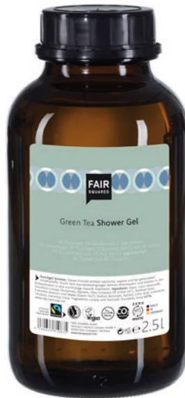
SHOWER GEL GREEN TEA

2500 ML COSMETAINER ART.-NO.: 4910477 EAN: 4260663810842