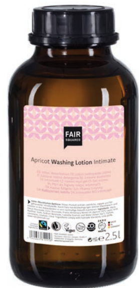
WASHING LOTION INTIMATE PH 4.5

2500 ML COSMETAINER ART.-NO.: 4910697 EAN: 4262358581624