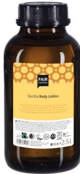
BODY LOTION VANILLA

2500 ML COSMETAINER ART.-NO.: 4910481 EAN: 4260663810880